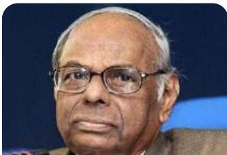
PROF. C. RANGARAJAN

Chairman – Madras School of Economics Chancellor – University of Hyderabad Ex-Governor – RBI Former President – Indian Statistical Inst.