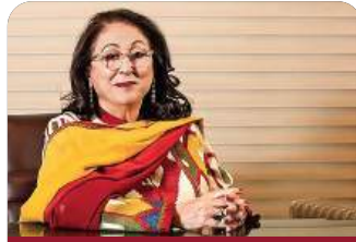
MRS. KIRAN NADAR

Founder – HCL Chairperson Emeritus & Strategic Advisor – HCL Tech Founder & Chairman – Shiv Nadar Foundation