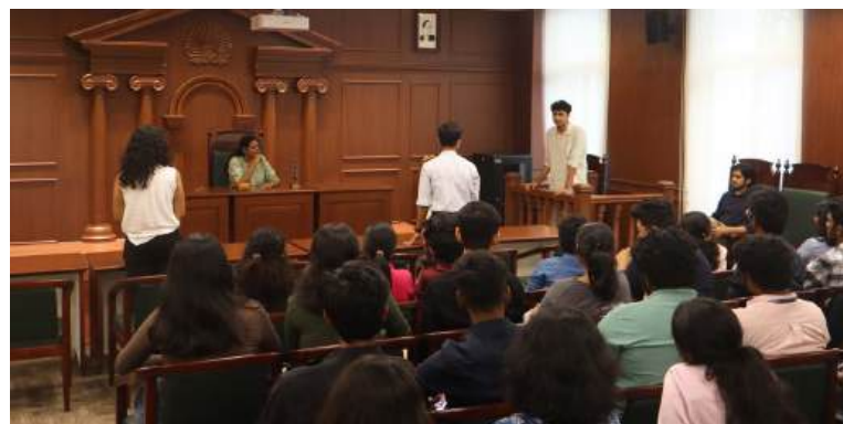
– Moot Court Session at the School of Law