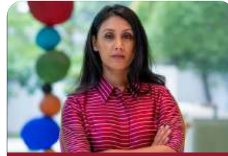
MRS. ROSHNI NADAR MALHOTRA

Chairperson – Kiran Nadar Museum of Art Trustee – Shiv Nadar Foundation