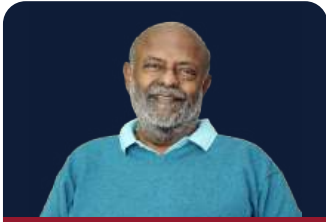
MR. SHIV NADAR

Founder – HCL Chairperson Emeritus & Strategic Advisor – HCL Tech Founder & Chairman – Shiv Nadar Foundation