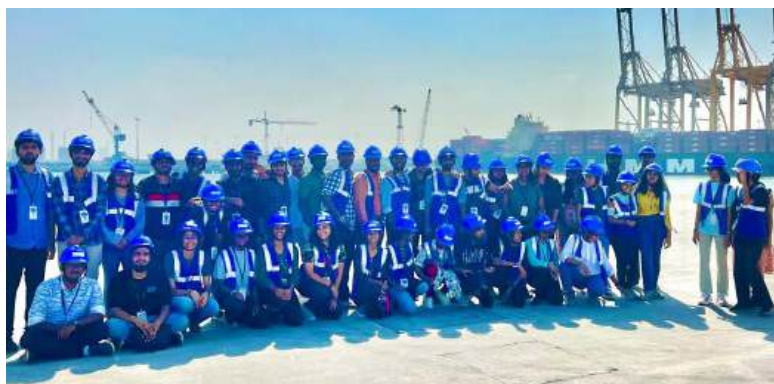
– Industrial Visit to Adani Port